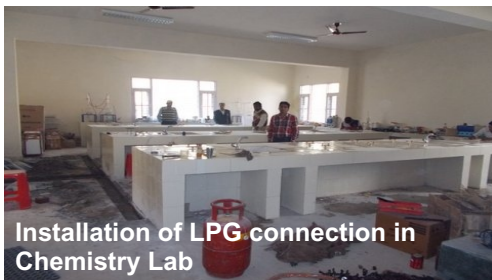
Installation of LPG connection in Chemistry Lab