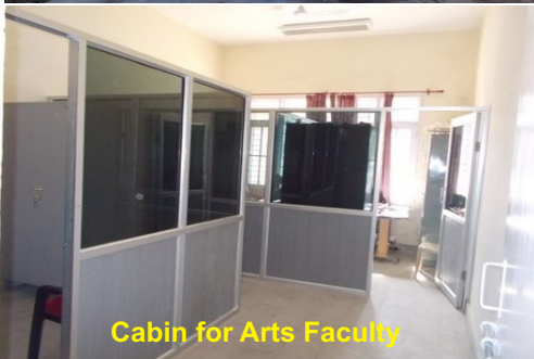
Cabin for Arts Faculty