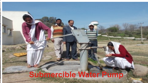
Submersible Water Pump