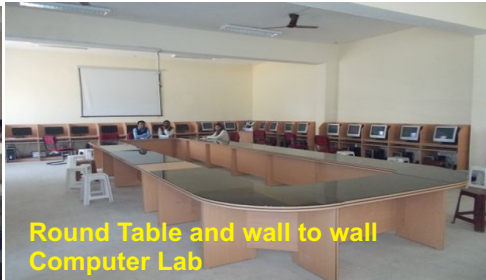
Round Table and wall to wall Computer Lab