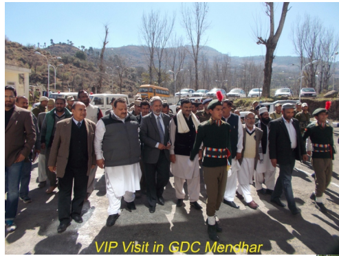
VIP Visit in GDC Mendhar