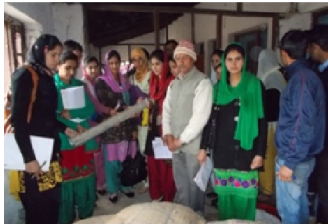
SVP showing feed and feeder at poultry farm Ari