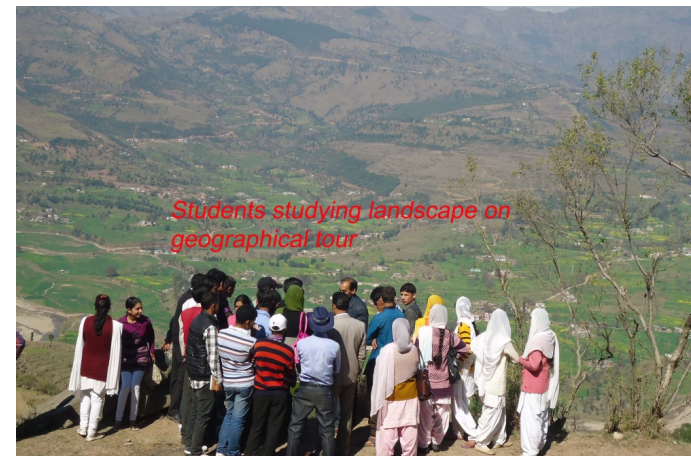
Students studying landscape on geographical tour