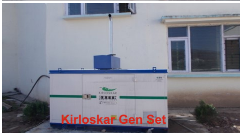
Kirloskar Gen Set