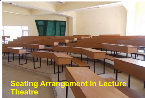
Seating Arrangement in Lecture Theatre