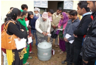
SVP showing cryopreservation of semen for artificial insemination in Animal Husbandry, Ari