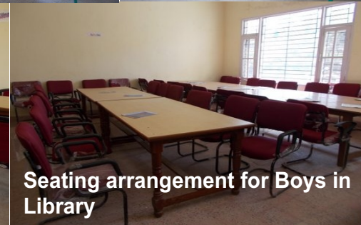
Seating arrangement for Boys in Library