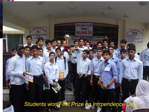
Students won First Prize on Intrepence Day