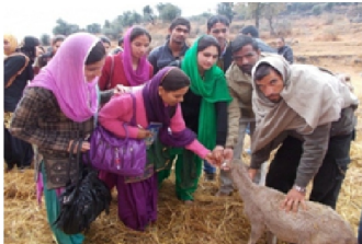
A Field Assistant Showing tagging of sheep